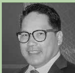
Dr. Uttama Savanayana Minister MINISTRY OF INFORMATION AND COMMUNICATION TECHNOLOGY OF THAILAND (Invited)